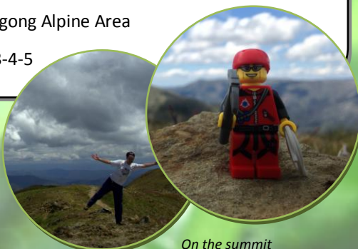
On the summit