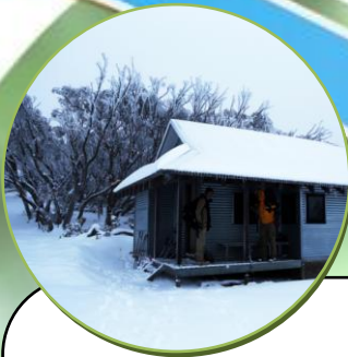
Federation Hut in winter