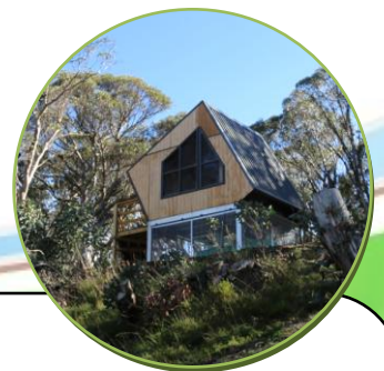
Best Loo in VIC